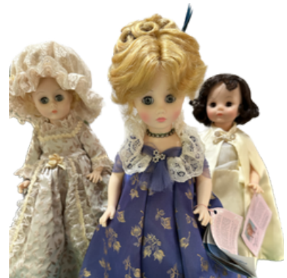
Presidential First Ladies dolls will be displayed in the gym.